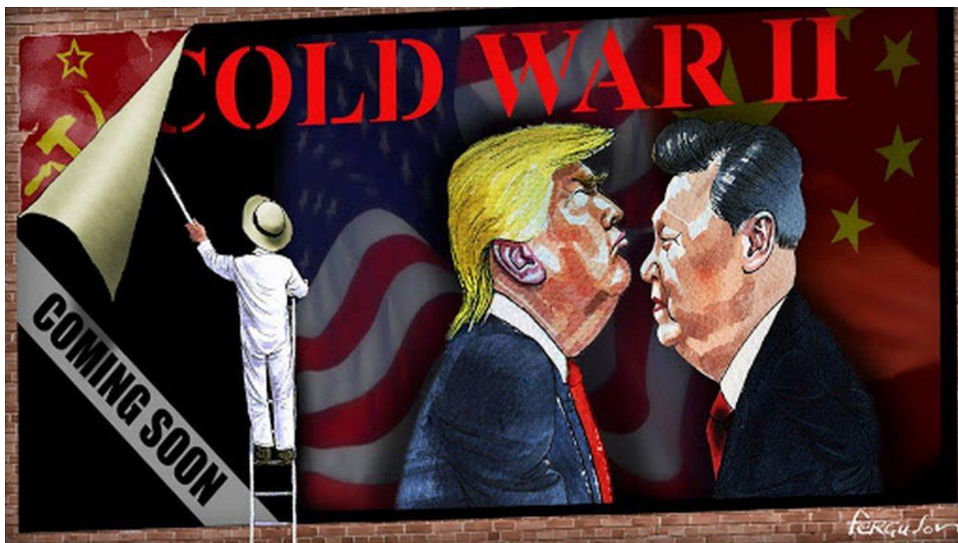
Has the Second Cold War already started?

Top experts in the field, such as the late Stephen Hawking, Martin Rees, Stuart Russell or Ray Kurzweil agree that the greatest and the earliest existential threat that we face is not the global warming but the loss of control over the development of AI. If it becomes malicious, then it may lead to the extinction of the human species in the next few decades. Incidentally, some experts believe that by 2030 we may reach simultaneously two tipping points, if there is no fast, global effort to mitigate such threats. It is the loss of control over the development of the Artificial Intelligence and the loss of control over the man-made global warming. Therefore, if we do not have a powerful World Government in the next decade, our last hope for saving a human species might be China. And that may be the ultimate goal of the Chinese leadership's behind this second cold war and the use of Immature Superintelligence to gain an absolute control over the world in order to save humans from themselves.